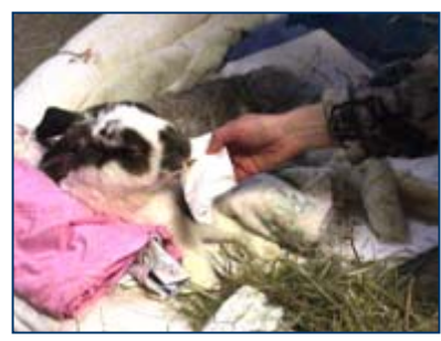
Toileting and Cecal Pellets

also waterproof to protect the carpet. (The carpet is a cheapie from Home Depot, so it's no biggie if it does get wet.) On top of the bubble wrap I laid plastic placemats where his butt would normally be (you could also use a scrap of linoleum). Just be sure the rabbit can't chew anything plastic. The next layer is fabric bedding. I used a body-size bath towel, then a couple of hand towels. (I had a lot of junk towels available, but you can buy towels at a Salvation Army store or a yard sale, etc.) I change Barney's bedding often to keep him dry and clean.