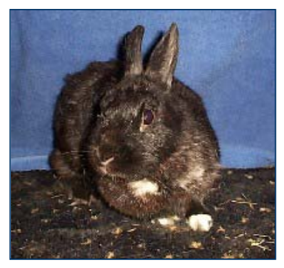
Our Bun of the Month is Patch!

HRN has over 50 rabbits currently in foster care, waiting for loving indoor homes. All have been spayed or neutered, socialized and litter-box trained. Visit our website to see their photos!